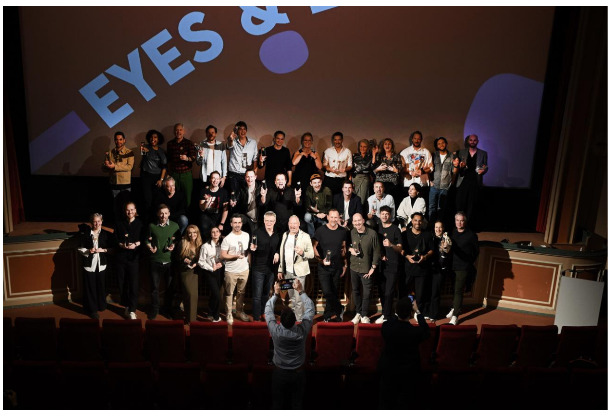
The winners of the 25th International Eyes & Ears Awards 2023

Cologne/Munich , 26 October 2023 - This year, the EYES & EARS were held once more as a presence event in Munich. And there was another special reason to celebrate: In the evening, the 25th International Eyes & Ears Awards were presented at the Filmtheater Sendlinger Tor.