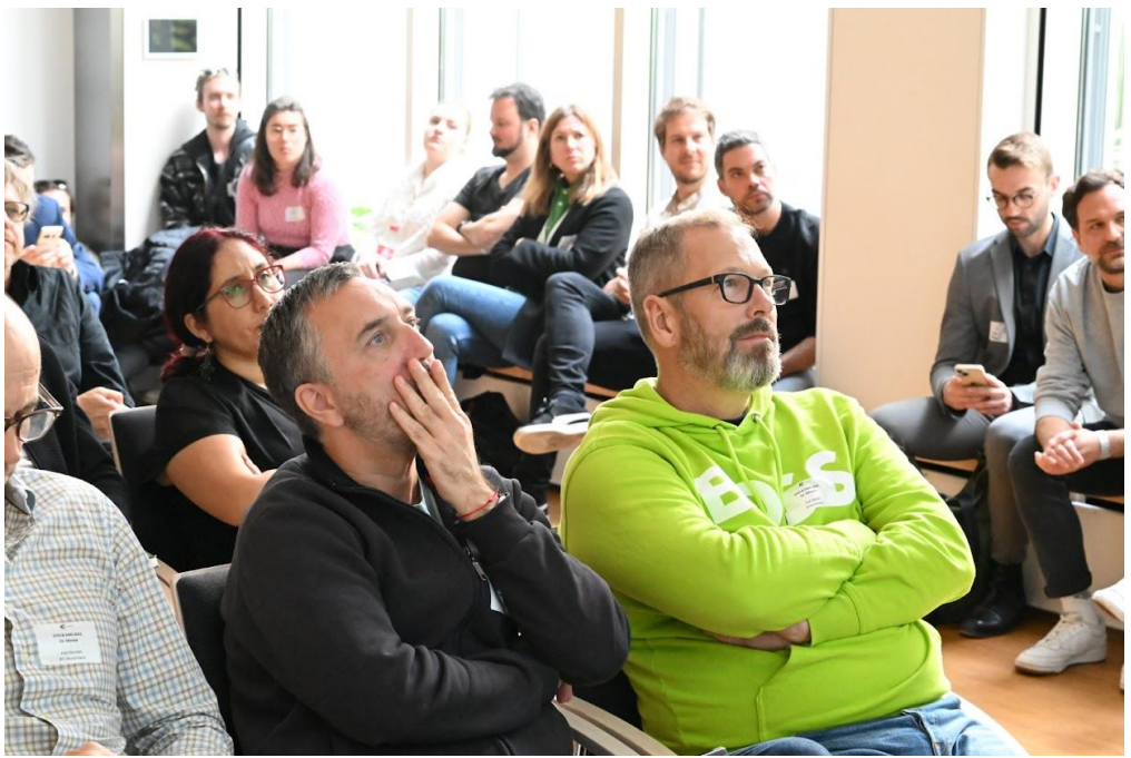
Audience of the very well attended master classes

These were very well appreciated and the speakers enjoyed full rows of seats.