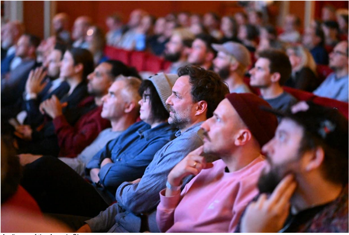
Audience of the Awards Show

A highlight of EYES & EARS was the presentation of the renowned 25th International Eyes & Ears Awards. On the occasion of the anniversary, these were also more international than they have been before. In