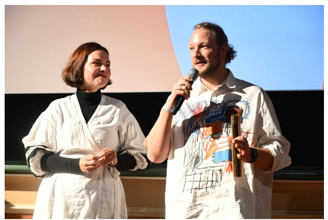
An emotional highlight: the presentation of the INSPIRATION Award to Banda Agency from Ukraine

The Eyes & Ears Special Awards 2023 went to the Ukrainian agency Starlight Creative: "Pictures from War" and to TV 2 Denmark: "The Copenhagen Bench" and their respective creative teams.